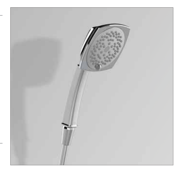
TS301FL55: Traditional Collection Series B Multi-Spray Handshower 4-1/2"

The multi-spray handshower shall have a maximum flow rate of 2.0 gpm (7.5 lpm). Product shall have a 4-1/2" handshower and a 4" diameter spray face. Product shall have 5 multifunction spray modes. Spray modes shall be spray, spray and massage combo, massage, mist and pause. Product shall have rubber nozzles to prevent limescale build up. Product shall be TOTO Model TS301FL55#____.