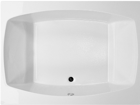
Features a textured bottom