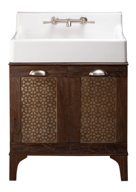
AVAILABLE SEPTEMBER 2015